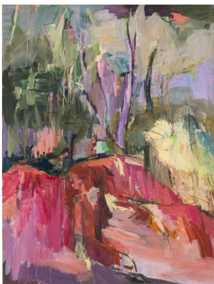
Entfaltung · 2025 · Öl auf Leinwand · 120 x 90 cm